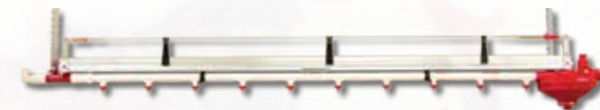
Aluminium Rail Support Option