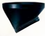
30° Drop Boot

Brodhan's clear boot allows producers to verify at a glance while driving by that feed is present in the bin. This heavy walled boot is injected molded from a specially formulated ultraviolet stabilized clear polycarbonate blend to provide years of trouble free service.