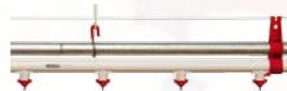
Round Pipe Support Option