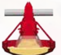
3.5" Locked Position