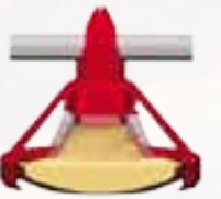
2" Collapsed Position